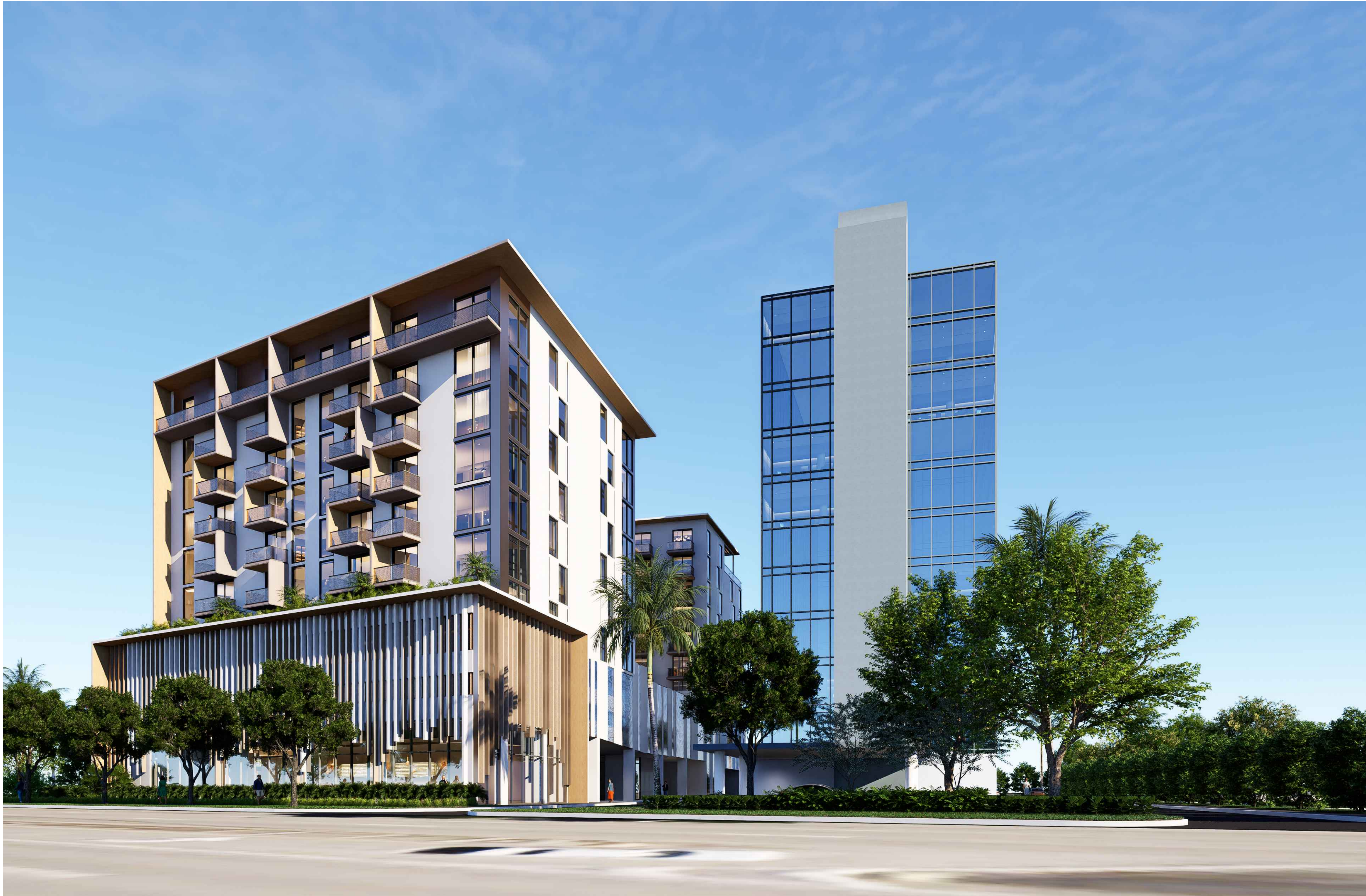
STREET VIEW OF THE SOUTH WEST CORNER OF THE BUILDING